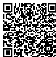
Health Savings Account